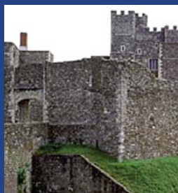
The Magnificent Dover Castle

There are many events through the summer to make Dover the place to visit: race-days, beer festival, WW1 weekends, Regatta, Carnival, Music in the Park and of course Bleriot Celebrations in July. Dover Castle events.